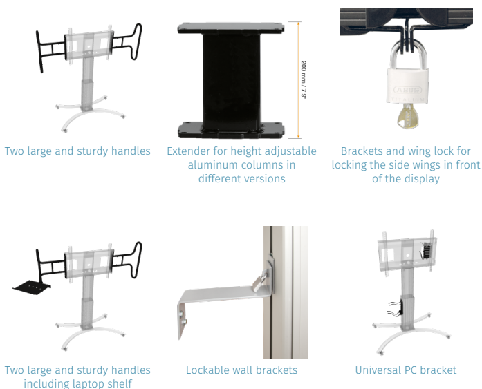
Two large and sturdy handles