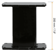
Extender for height adjustable aluminum columns in different versions