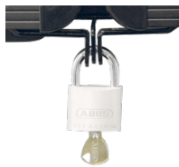
Brackets and wing lock for locking the side wings in front of the display