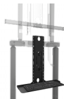
Keyboard tray for DCS system