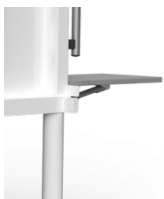
Accessories - "VST-MS Side tray, foldable".