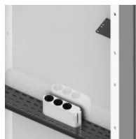
Accessories - "3-way power strip, 5 m cable detachable".