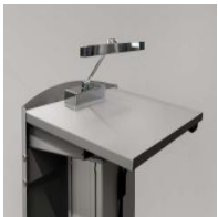
Accessories lectern - "LED picture light".