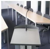
Accessories lectern - "LED gooseneck lamp".