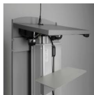
Accessories tray for mounting on the column - "Lectern-S".