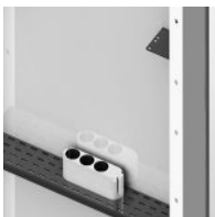
Accessories - "3-way power strip, 5 m cable detachable".