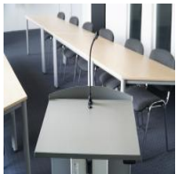
Accessories lectern - "Cutout for gooseneck microphone".

Lectern accessories - installation of a power on/off switch for media technology