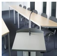
Accessories lectern - "Cutout for gooseneck microphone".