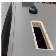
Lectern accessories - Cut-out for control panel/touch panel