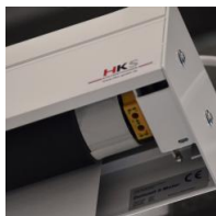
Motor drive - left