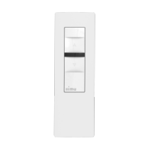
Radio remote control 1-channel with hand-held transmitter