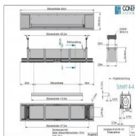
Congress-S pre-assembly frame - for 500 cm screen width