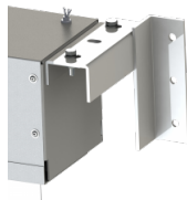
Wall bracket without spacing for Congress-S (housing 20 x 20)