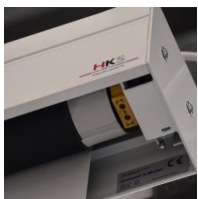
Motor drive - left