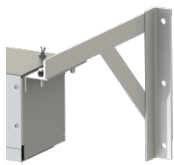
Wall spacer 30 cm for Congress-S (housing 20 x 20)