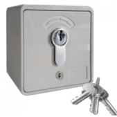
Key switch on plaster for Congress-S

Radio remote control - external - with 1-channel hand-held transmitter (Congress-S)