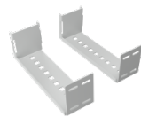
Wall spacer 20 cm (for Dolomit II / Scala II)