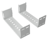
Wall spacer 30 cm (for Dolomit II / Scala II)