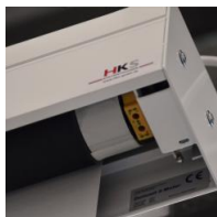
Motor drive - left