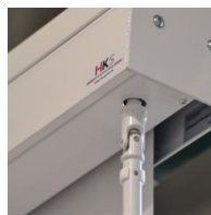
Crank drive - left