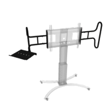
Two large and sturdy handles including laptop shelf