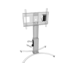
Universal PC bracket