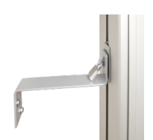
Lockable wall brackets