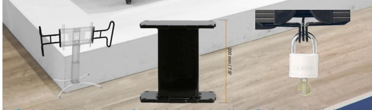
Two large and sturdy handles