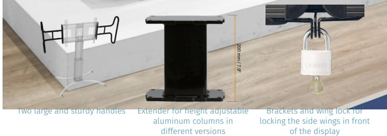
Two large and sturdy handles