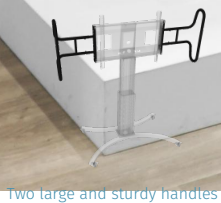
Two large and sturdy handles including laptop shelf