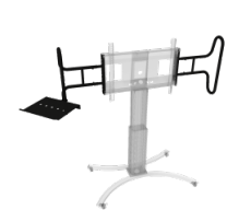
Two large and sturdy handles including laptop shelf