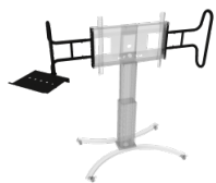
Two large and sturdy handles including laptop shelf