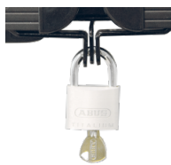
Brackets and wing lock for locking the side wings in front of the display