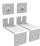
2 galvanized wall mounting brackets