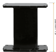
Extender for height adjustable aluminum columns in different versions