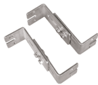
2 galvanized adjustable wall mounting brackets