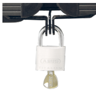
Brackets and wing lock for locking the side wings in front of the display