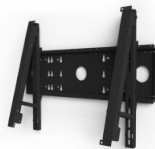
LCD mount - Surface Hub 25 85"