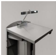
Accessories lectern - "LED picture light".