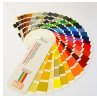
Surcharge for special paint finish for presentation furniture