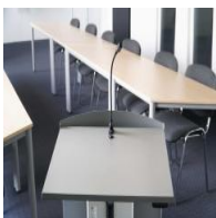
Accessories lectern - "LED gooseneck lamp".