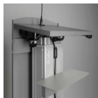
Accessories tray for mounting on the column - "Lectern-S".