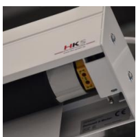
Motor drive - left