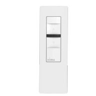
Radio remote control 1-channel with hand-held transmitter