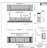
Congress-S pre-assembly frame - for 500 cm screen width