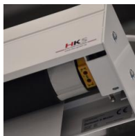
Motor drive - left