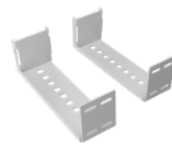
Wall spacer 20 cm (for Dolomit II / Scala II)