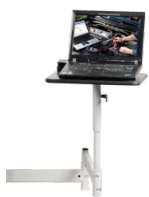
Swivel arm for notebooks