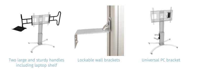
Two large and sturdy handles including laptop shelf