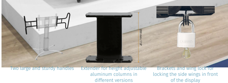
Two large and sturdy handles