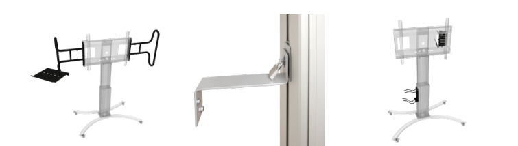
Two large and sturdy handles including laptop shelf