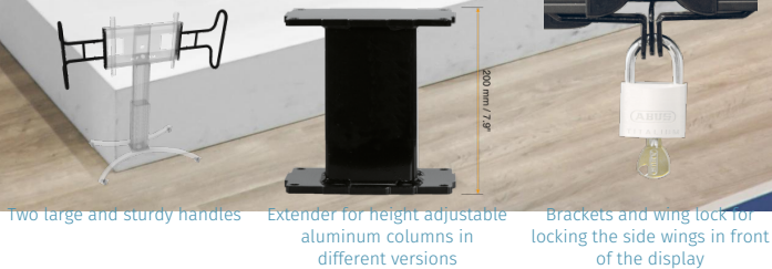
Two large and sturdy handles Extender for height adjustable aluminum columns in different versions Brackets and wing lock for locking the side wings in front of the display