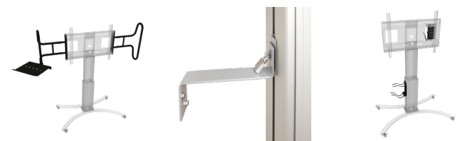
Two large and sturdy handles including laptop shelf Lockable wall brackets Universal PC bracket