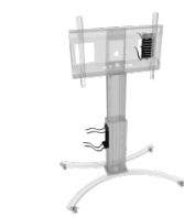
Universal PC bracket