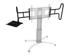
Two large and sturdy handles including laptop shelf