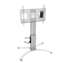
Universal PC bracket